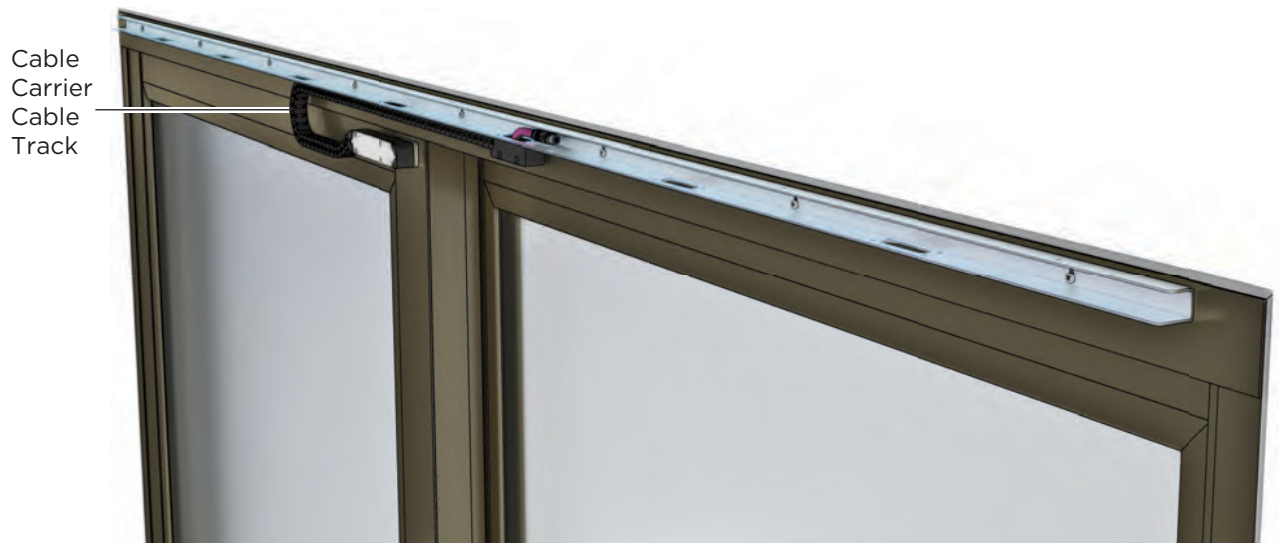
CABLE CARRIER (E) Cable Track in contracted position with door closed.