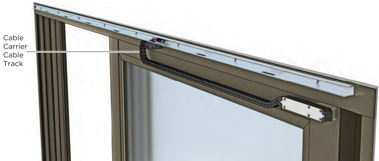
CABLE CARRIER (E) Cable Track in extended position with door open.

The Carrier Cover is not included in the following illustrations to reveal operations of the Cable Carrier. For most automatic doors with egress, the Internal Break away pivot bolt, must be modified to accommodate IGU cable.